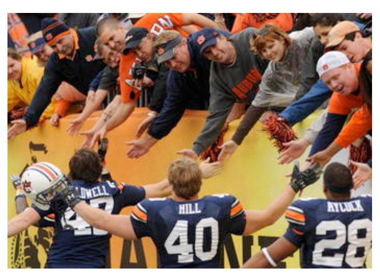
Al Messerschmidt/Getty Images