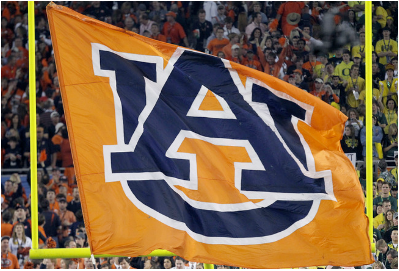
Auburn could be better than people think

It's hard to find a positive attitude about Auburn in the press with just a few exceptions.